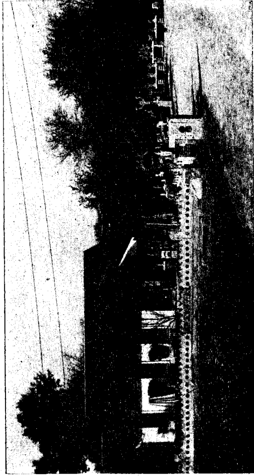
RAY'S ORNAMENTAL GARDENS • STEPHENVILLE, TEXAS